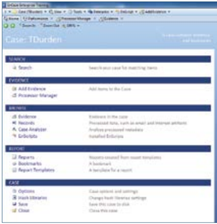
Concurrent case management views enable greater speed and efficiency.