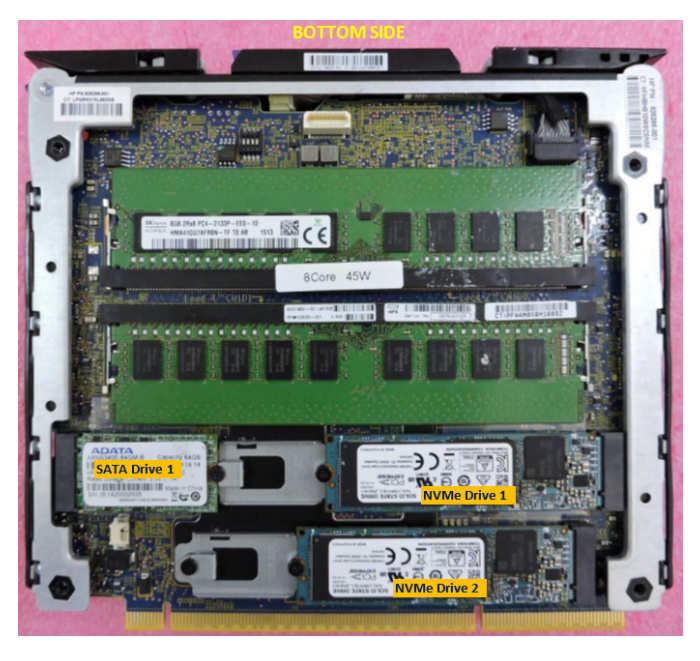
Figure 5. Available SATA slots