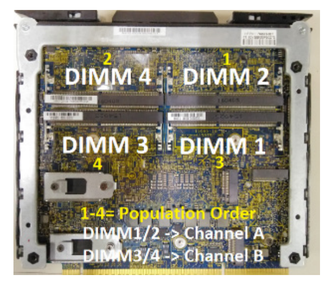
Figure 1. HPE ProLiant m710x server blades DIMM load slots