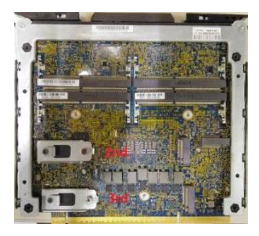
Figure 3. Recommended SSD loading rules on HPE ProLiant m510 server blades (back)