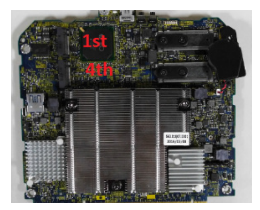
Figure 2. Recommended SSD loading rules on HPE ProLiant m510 server blades (front)