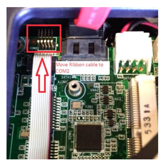
Figure 7. Serial port configuration