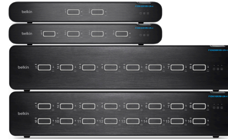
Front of Universal 2nd Generation Secure KVMs