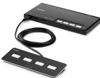
4-Port Dual Head Modular Secure KVM Switch Base Unit PP4.0 W/ Remote F1DN204MOD-BA-4