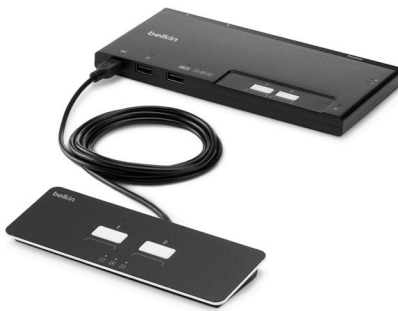
2-Port Dual Head Modular Secure KVM Switch Base Unit PP4.0 W/ Remote F1DN202MOD-BA-4