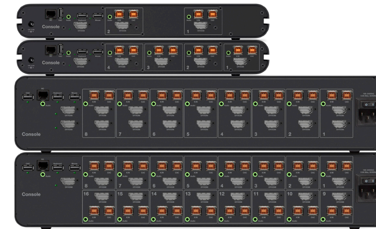
Rear of Universal 2nd Generation Secure KVMs