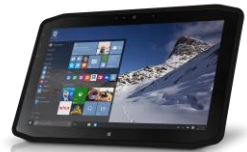
XSLATE R12 12.5" Rugged Windows Tablet