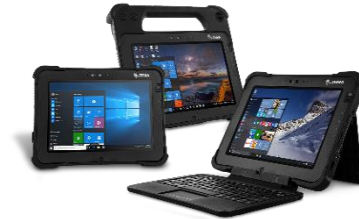
L10 Windows 10" Rugged Windows Tablet (3 form factors)