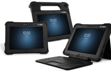
L10 Android 10" Rugged Android Tablet & 2-in-1 (3 form factors)