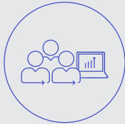
60 SMART amp licenses for 1 year