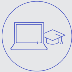
10 11.6" Chromebook 3 (choice of 2GB or 4GB)