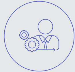
10 Google Device Management Console licenses