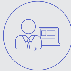
10 SMART Educator Professional Development modules for 1 year