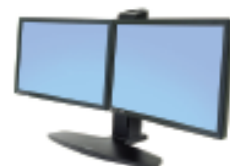
Neo-Flex Lift Stands

Our territory account managers are strategically located across the United States and Canada. They are available for sales calls and training, and can answer any questions you may have.