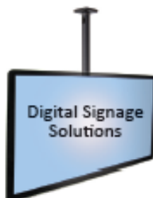
Digital Signage Solutions