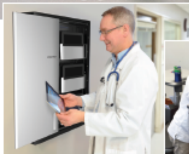
Tablet Charging Wall Mounts