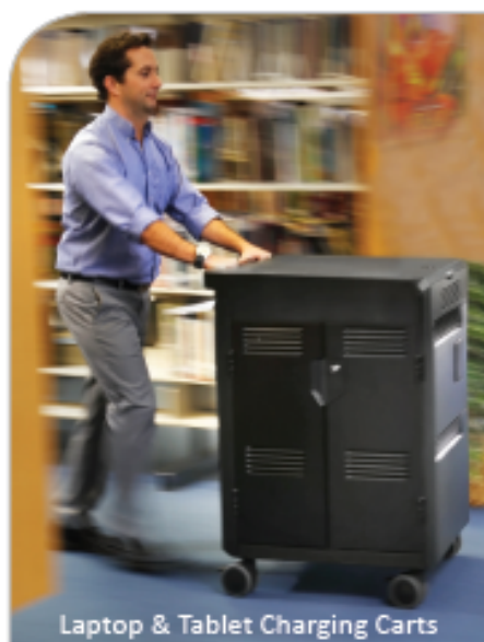
Laptop & Tablet Charging Carts