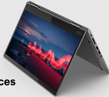
Prize: X1 Yoga (20UB0067US)

Earn One (1) ballot for every $1000 Lenovo Commercial or Lenovo Enterprise Warranty Services sold through TD SYNEX.