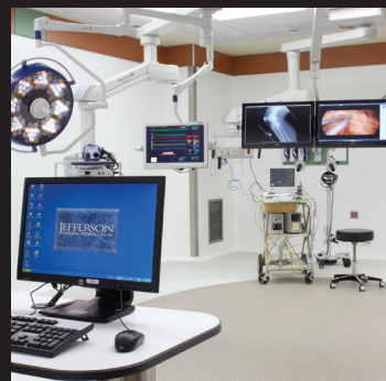
KVM Switching and Extension