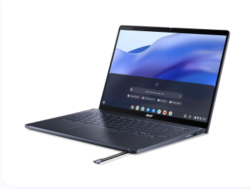
Chromebook Enterprise 714

A range of professional-grade device with enhanced power, speed, memory, and storage.